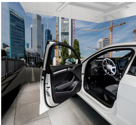
Fig. 2 Fraunhofer IOSB has a driving simulator equipped with extensive sensors in the vehicle interior, which was designed specifically for conducting studies and collecting data.